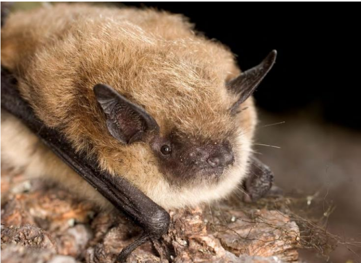
Yuma myotis ( Myotis yumanensis )