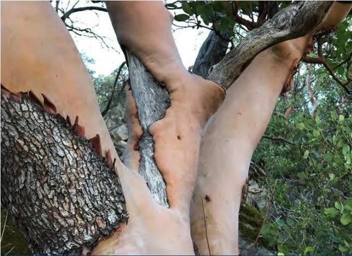
Pacific madrone ( Arbutus menziesii )