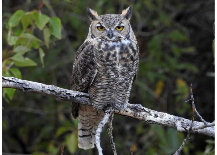
Great horned owl ( Bubo virginianus )