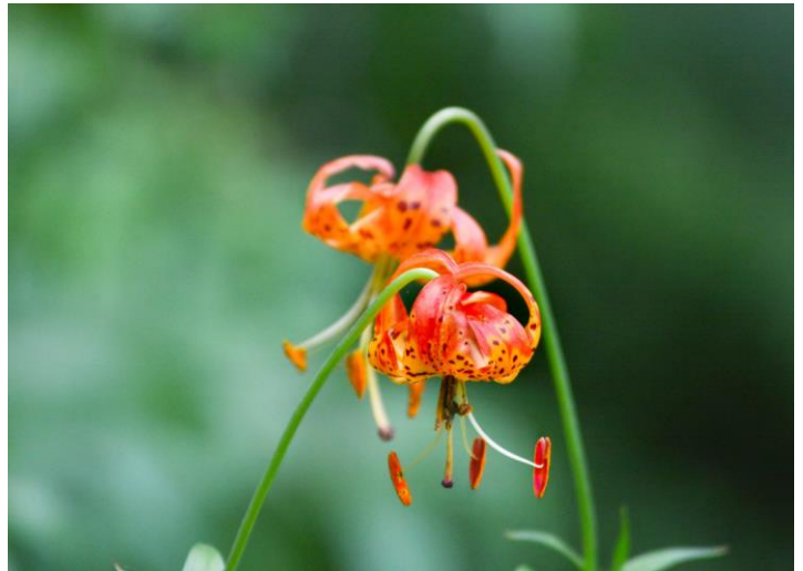
Leopard lily ( Lilium pardalinum )