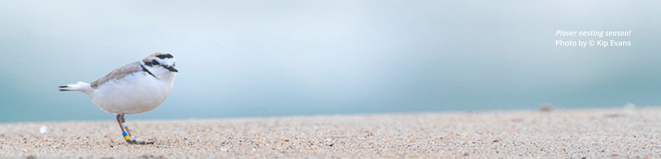
Plover nesting season!