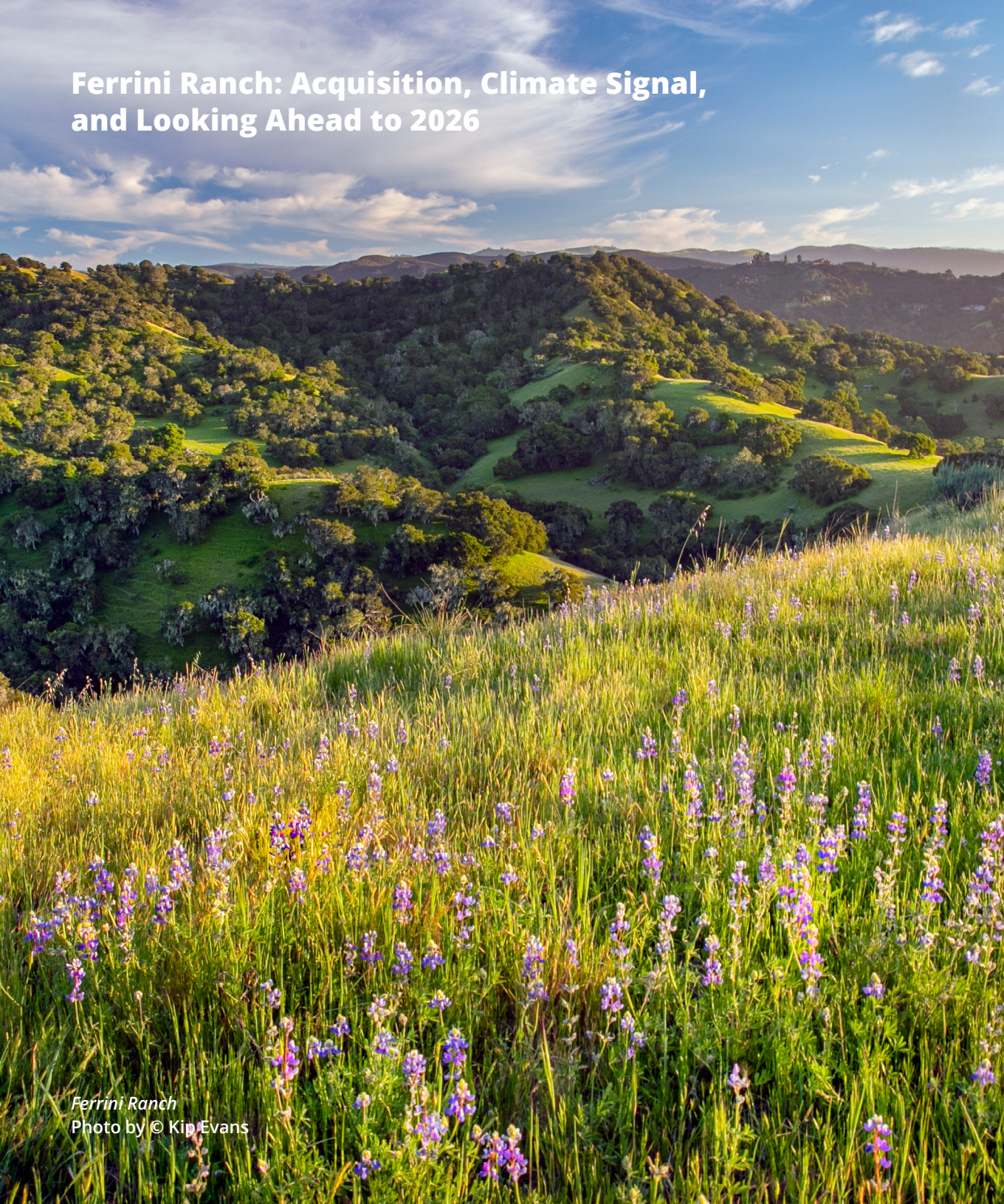
Ferrini Ranch

The permanent protection of Ferrini Ranch represents a defining moment for one of the most visible and ecologically important landscapes on California's Central Coast.