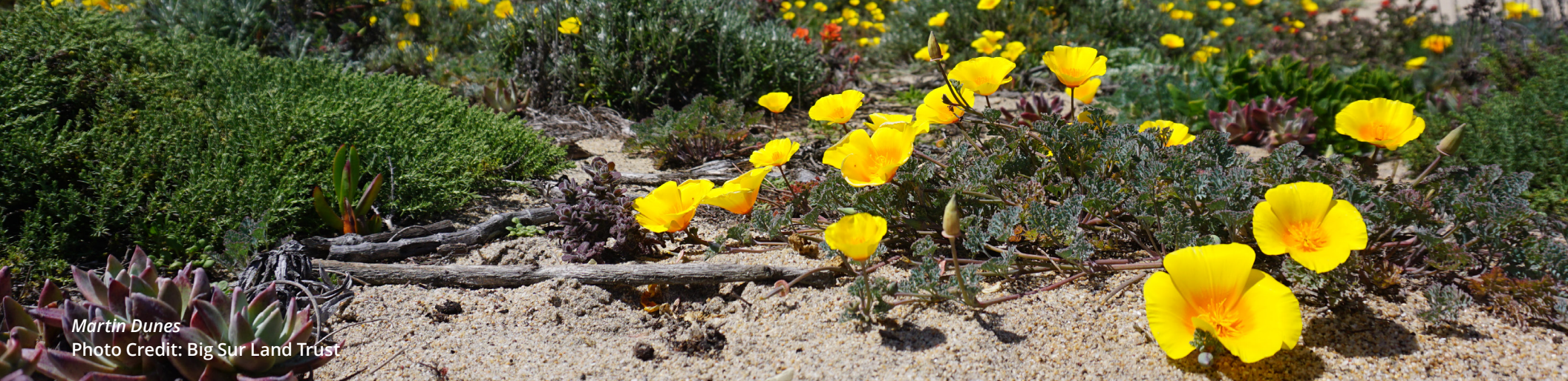
Martin Dunes

Dear Friends, This year, I've found myself returning to a simple but powerful idea: when we care for the land, we care for each other.