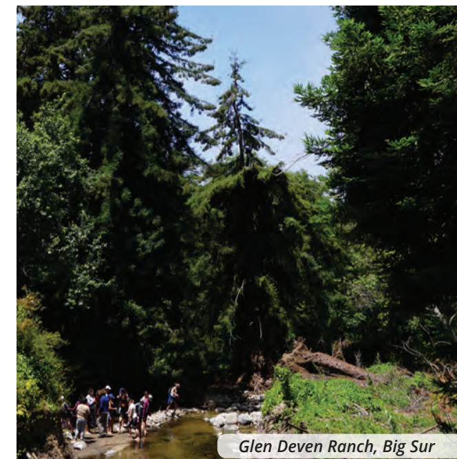
Glen Deven Ranch, Big Sur