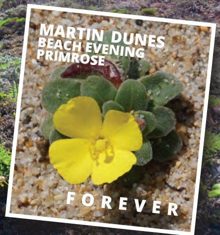
Martin Dunes, Marina