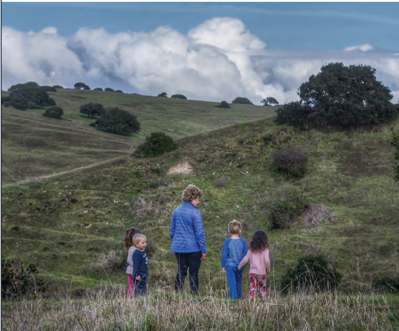
Marks Ranch, Salinas

Self-guided hikes on some of our conserved properties are a benefit for current BSLT supporters. Do you want to join our efforts to provide places where people and nature thrive? Renew your support at www.bigsurlandtrust.org .